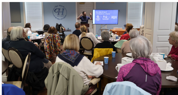
2025 Lunch & Learn about Artificial Intelligence.

Take a traveler's journey through Argentina and Morocco – all from the comfort of your seat! Explore tango in Buenos Aires and the end of the world in Tierra del Fuego. Then, travel through Morocco, visiting Fez, Marrakesh and the Sahara. Lunch is provided, so come hungry for food and adventure!