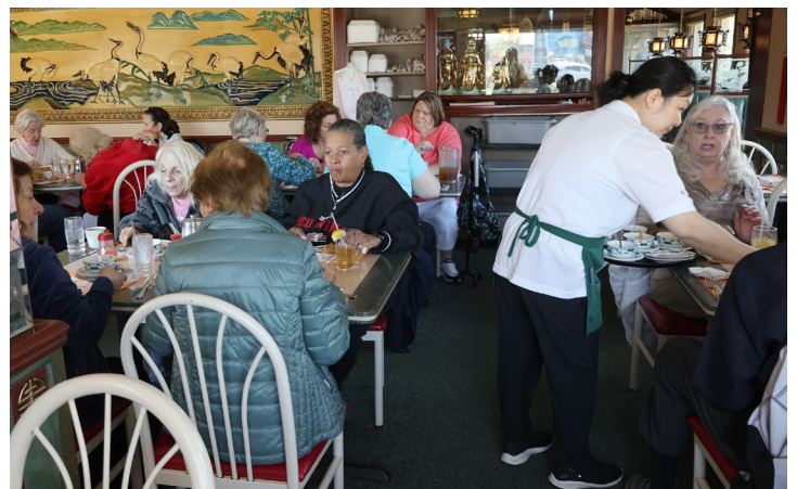
A recent Out-to-Lunch Bunch outing.

Come and learn about these trips, costs and everything that's included. We can't do them justice here!