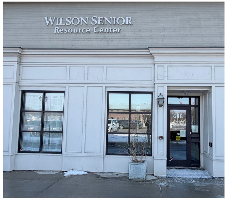
The Adult Day Program entry off the private road between Kercheval and St. Clair abutting the municipal parking lot.

We'll have more details about the program in a couple of months, but in the meantime, please read more about